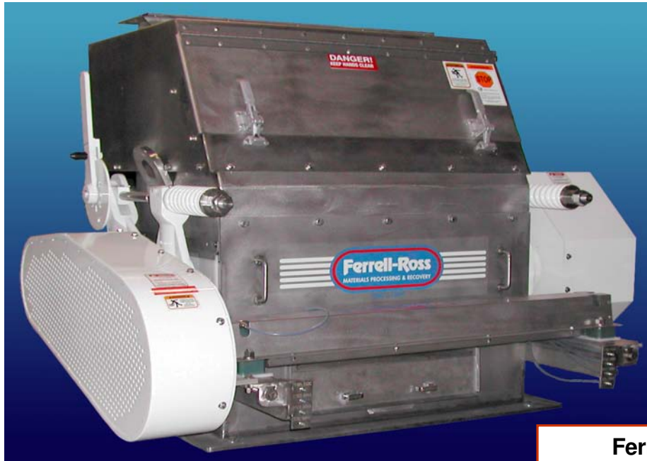
Ferrell-Ross 10 x 36 Stainless Steel Single Hi Industrial Mill

When greater size reduction is required a Ferrell-Ross Industrial Series Mill may be the solution. The Ferrell-Ross Single Hi Industrial Mills are ideal when the finished product needs to be of a coarse nature.