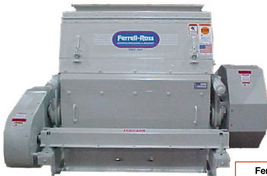
Ferrell-Ross 12 x 52 Single Hi Cracking Mill

When consistent particle size reduction is required, a Ferrell-Ross Cracking or Grinding Mill may be the solution. The Ferrell-Ross Single-Hi Roller Mills are ideal when the finished product needs to be of a course nature. Heavy-duty construction and quality components provide years of reliable service. Ferrell-Ross mills have demonstrated outstanding performance in various applications around the world